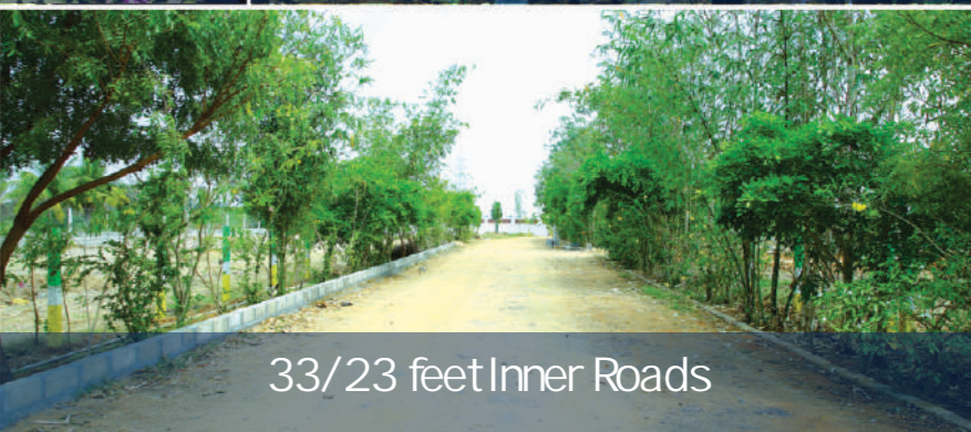
33/23 feet Inner Roads